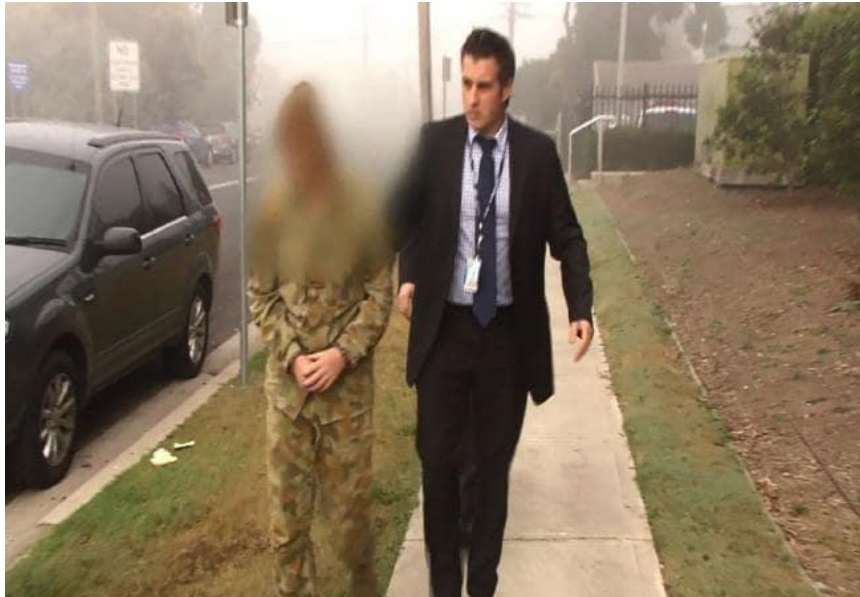
A serving member of the Australian Defence Force is arrested over the armed robbery in 2014.

The court heard the parties were in negotiations on some of the charges and asked for the case to be adjourned for four weeks.