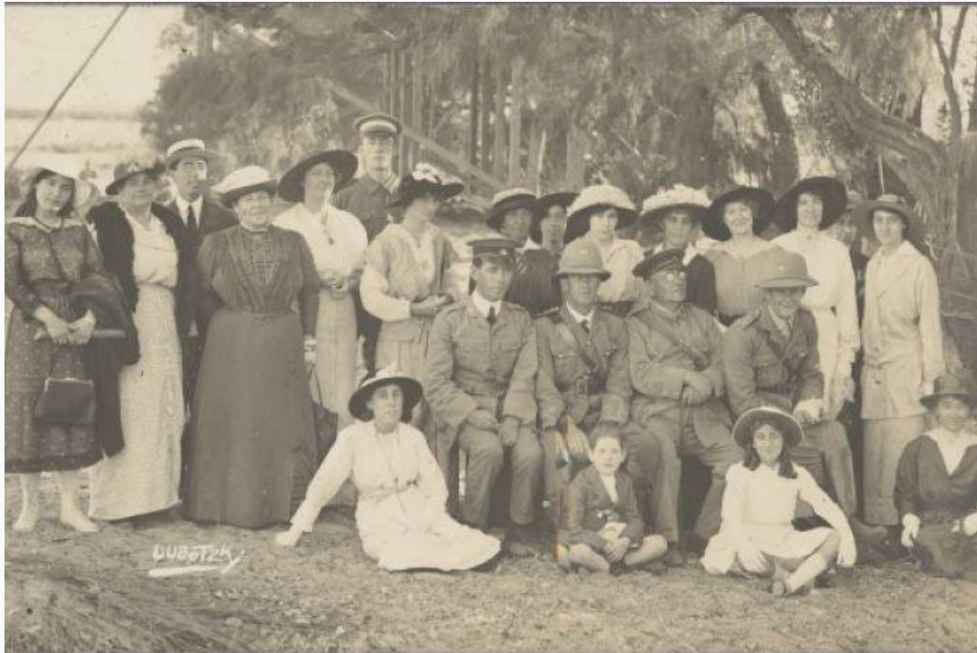
Photo: A group of internment camp staff with women and children. There is confusion over the origins of the women and children in this photo, with one source stating they are members of Adelaide's Cheer Up Group and another stating they are relatives of officers (vn4703393-s115)