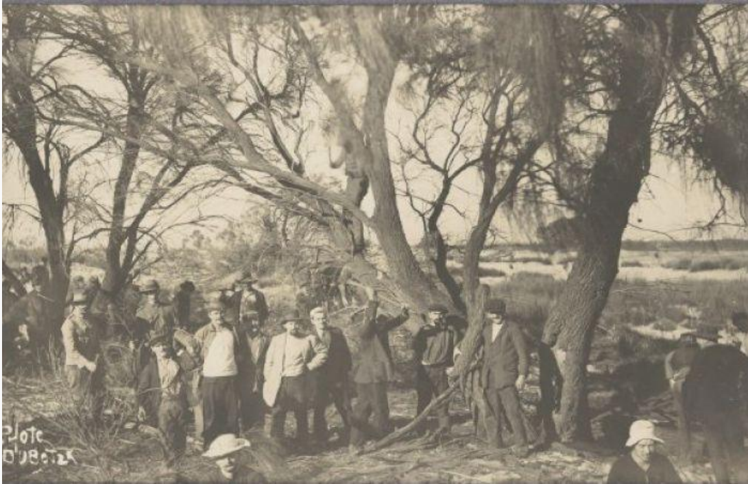
Photo: Internees collecting firewood on Torrens Island (vn4703393-s116) . (National Library of Australia: Paul Dubotzki)