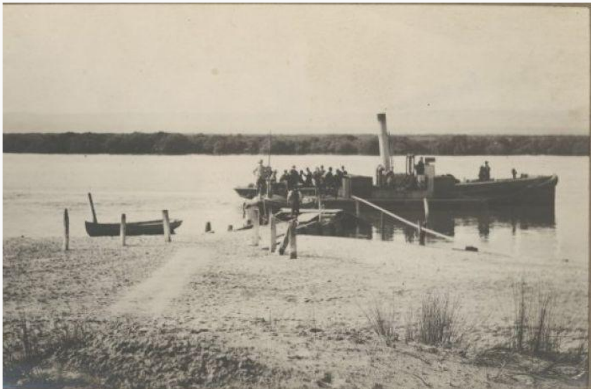
Photo: Motor launch landing internees at Torrens Island Internment Camp (vn5016734).