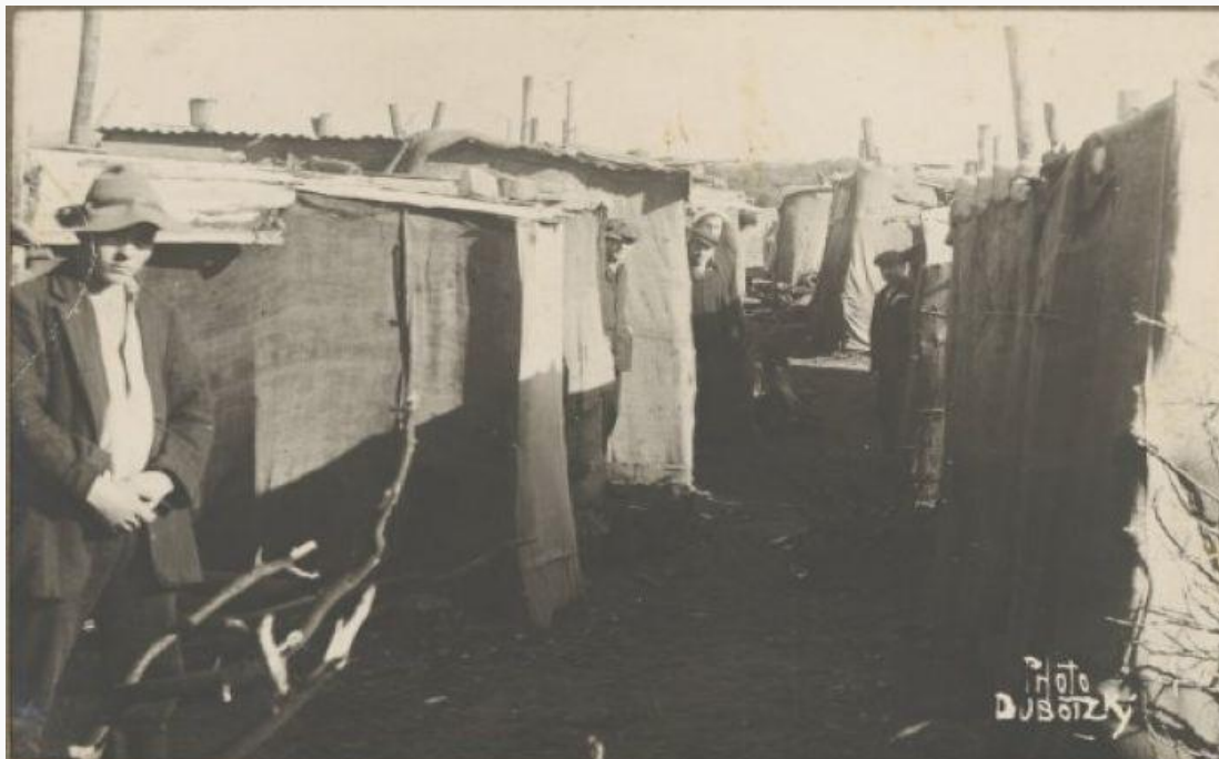
Photo: Accommodation at the Torrens Island Internment Camp (vn5016744). (National Library of Australia: Paul Dubotzki)