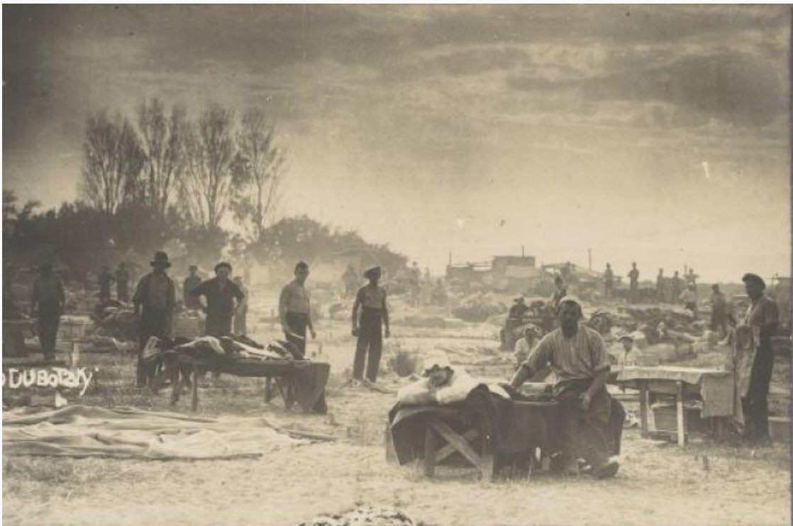
Photo: Internees at Torrens Island Camp (vn4703393-s117) .