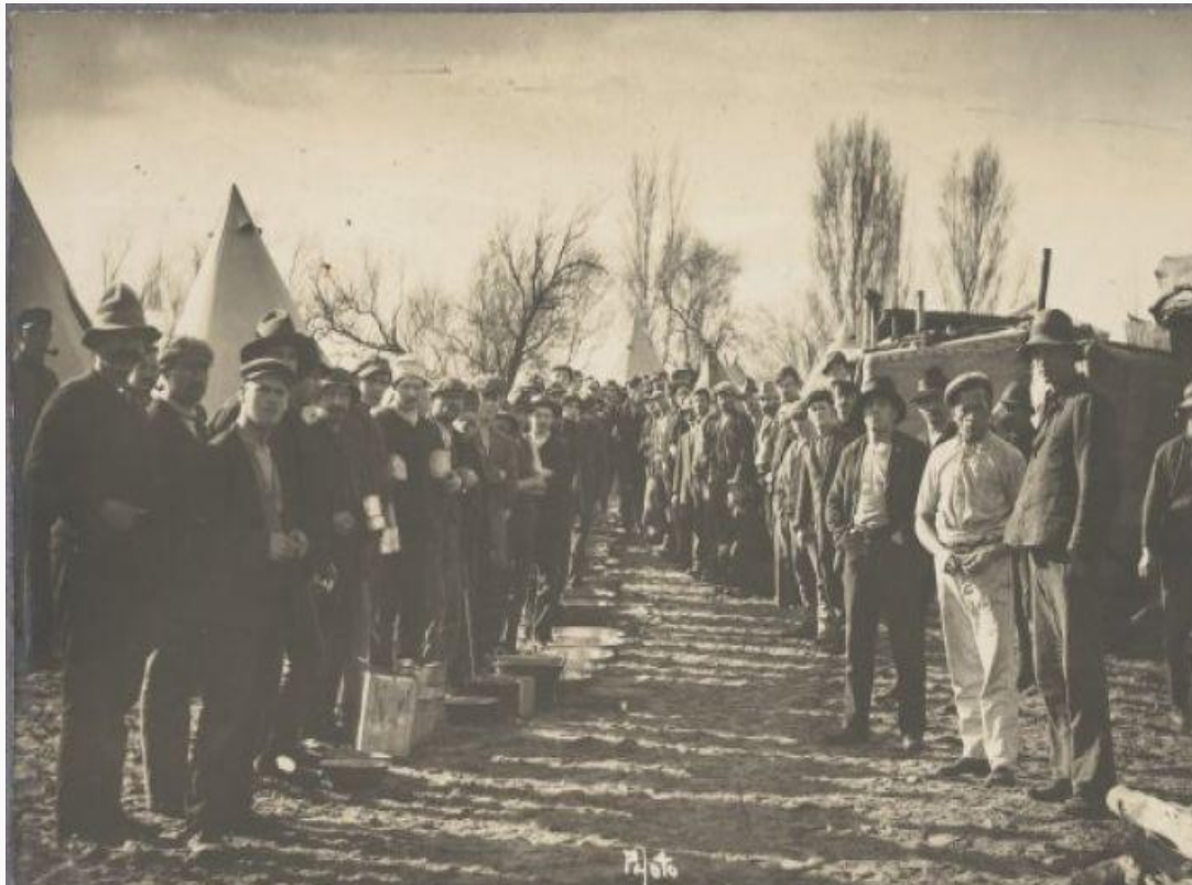
Photo: Internees lining up for water rations at the Torrens Island Internment Camp (vn4703393-s117). (National Library of Australia: Paul Dubotzki)

Updated 10 Oct 2014, 1:12pm Fri 10 Oct 2014, 1:12pm