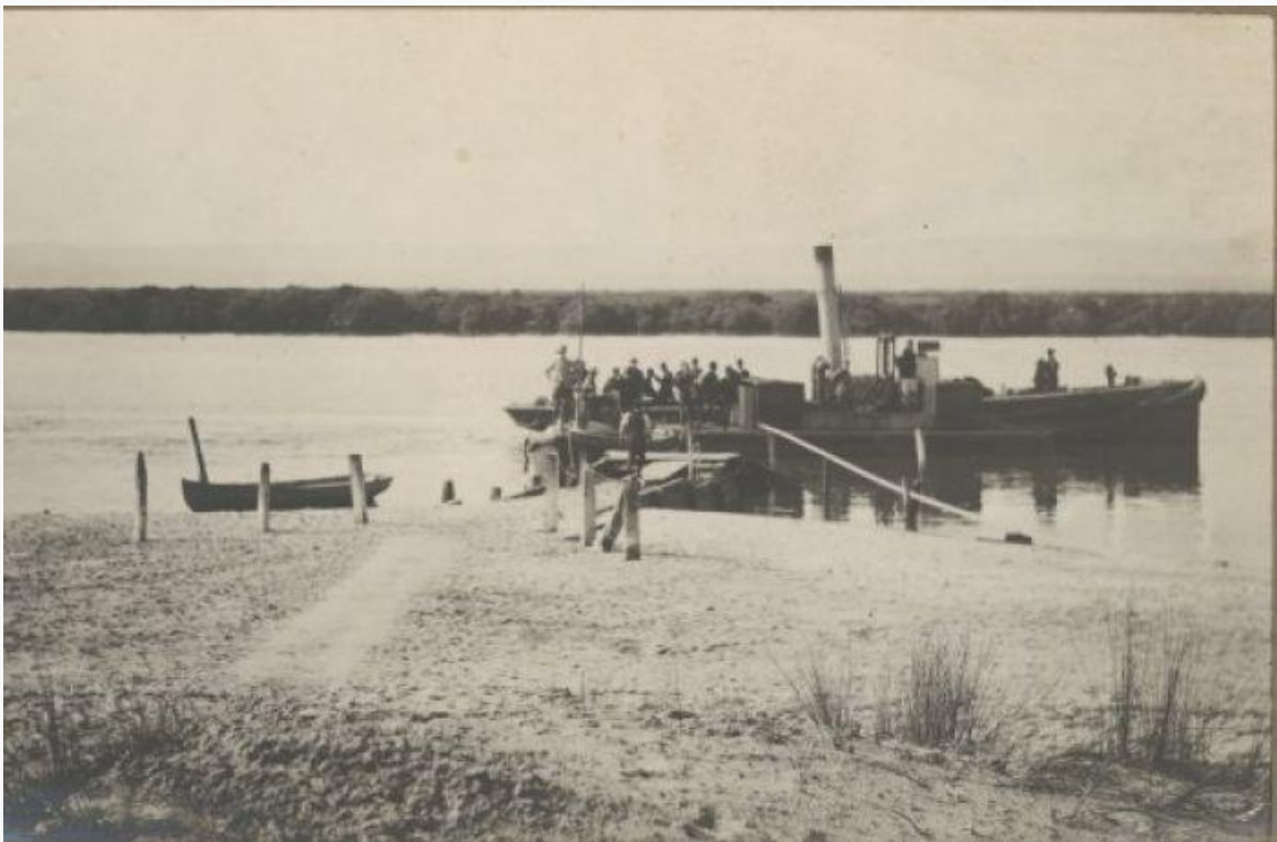
Photo: Motor launch landing internees at Torrens Island Internment Camp (vn5016734).