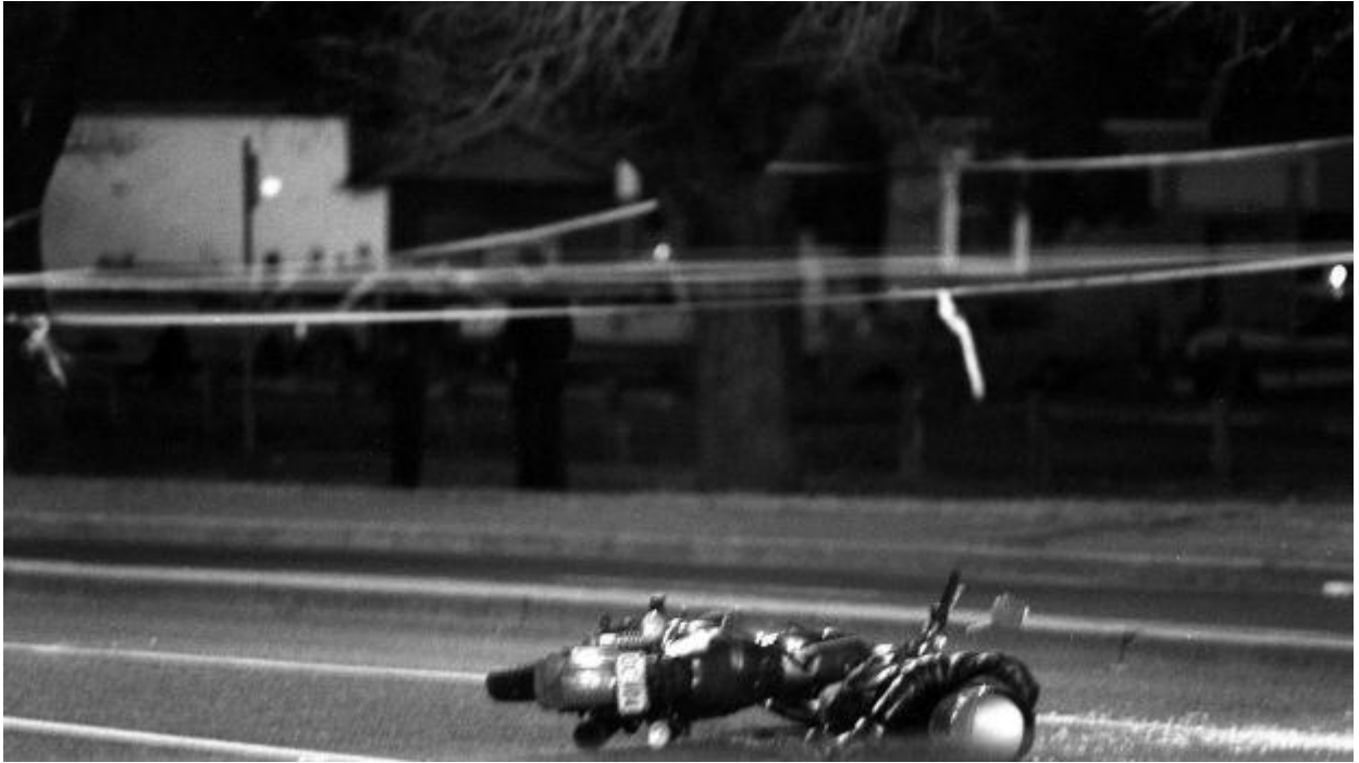
Hoddle Street: a victim lies on the road.

In just 38 minutes the 19-year-old failed (and bullied) army officer candidate fired 200 rounds of high-grade ammunition, killing seven people, wounding a further 19 and nearly shooting the police helicopter out of the sky.