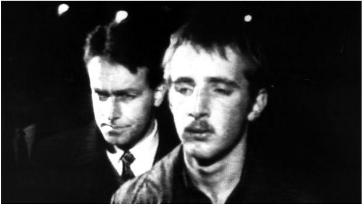
Scenes from the shooting in Hoddle Street in 1987.

But there were other heavyweights who didn't warm to him. In 1993 prison authorities discovered a mass escape plot involving up to 30 inmates in Pentridge's notorious H Division. The plan included attacking Knight in his cell.