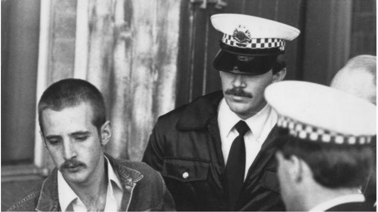
Julian Knight, left, being taken away by police after the Hoddle Street shooting.

While Knight was not a model prisoner (there were a few minor assaults and discipline issues) he was usually well behaved. "He quickly learned to fly under the radar and keep a low profile," a veteran Pentridge officer said. "He didn't steal anything and didn't try to stand over anyone."