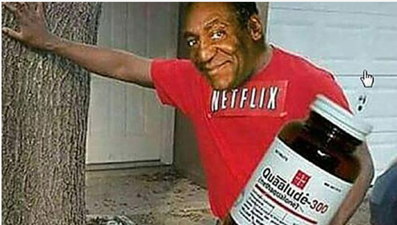
Facebook posts by Australian soldiers

The Defence spokesman said: "Army does not condone offensive or inappropriate behaviour and such conduct does not represent the ethos of the majority of Army's members.